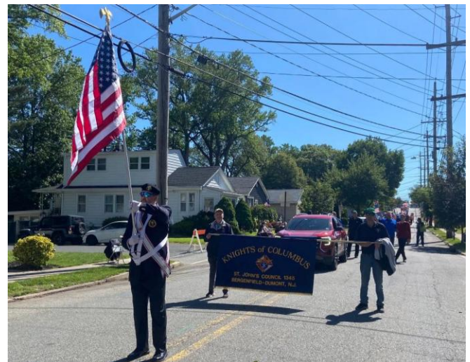
St. John's Council #1345 at the Dumont Memorial Day Parade