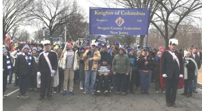
Our two busloads of participants to the March for Life on Jan. 18, 2019.